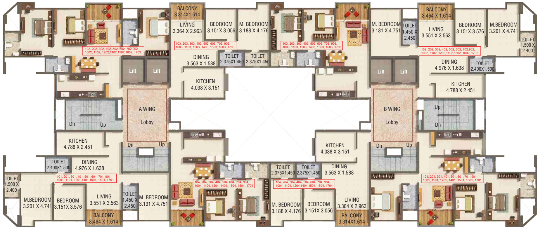
BUILDING H2 - A WING AND B WING TYPICAL FLOOR (AREA IN SQ.M)