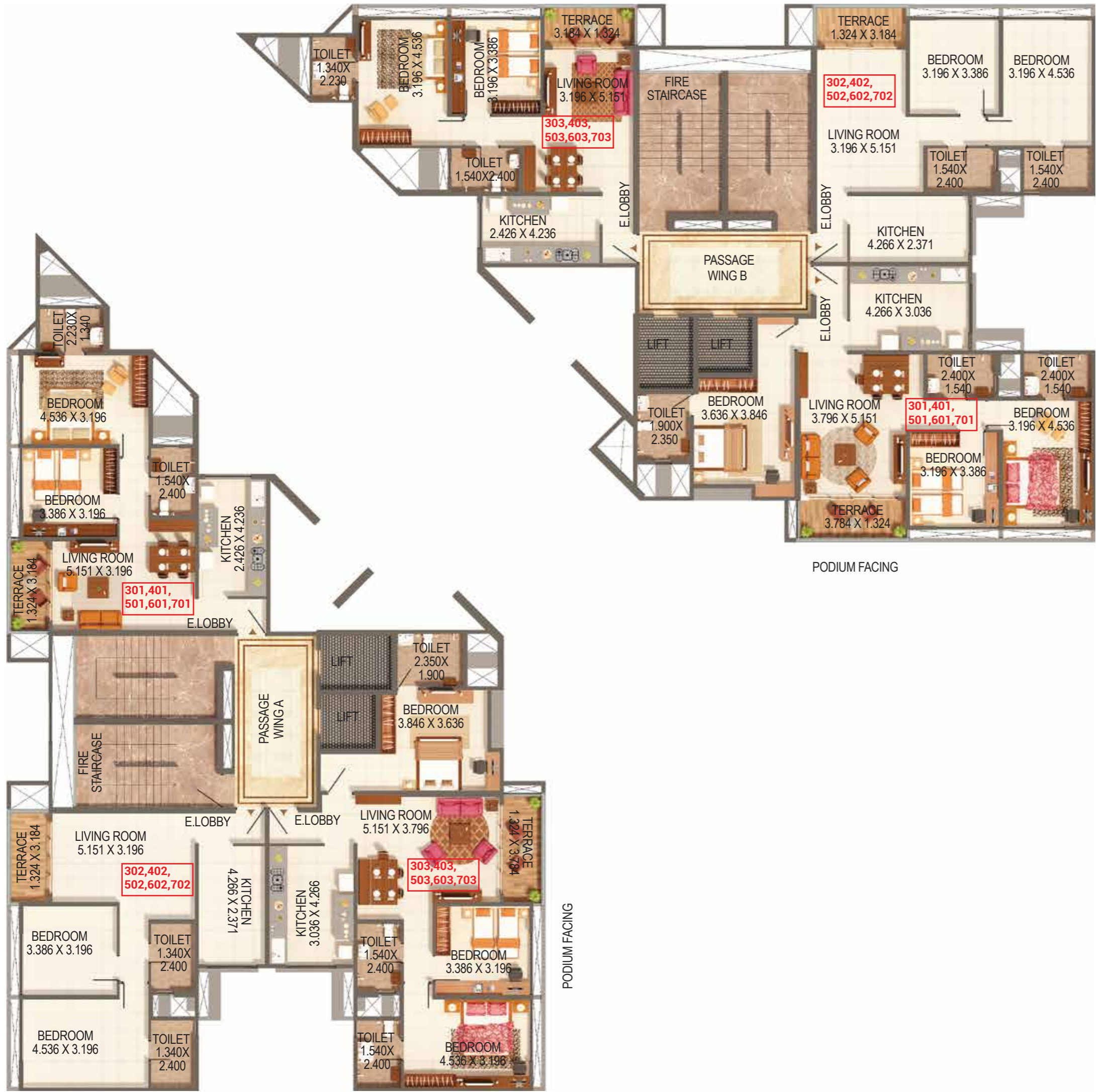
BUILDING 'B2' 3rd to 7th FLOOR (AREA IN SQ. M)