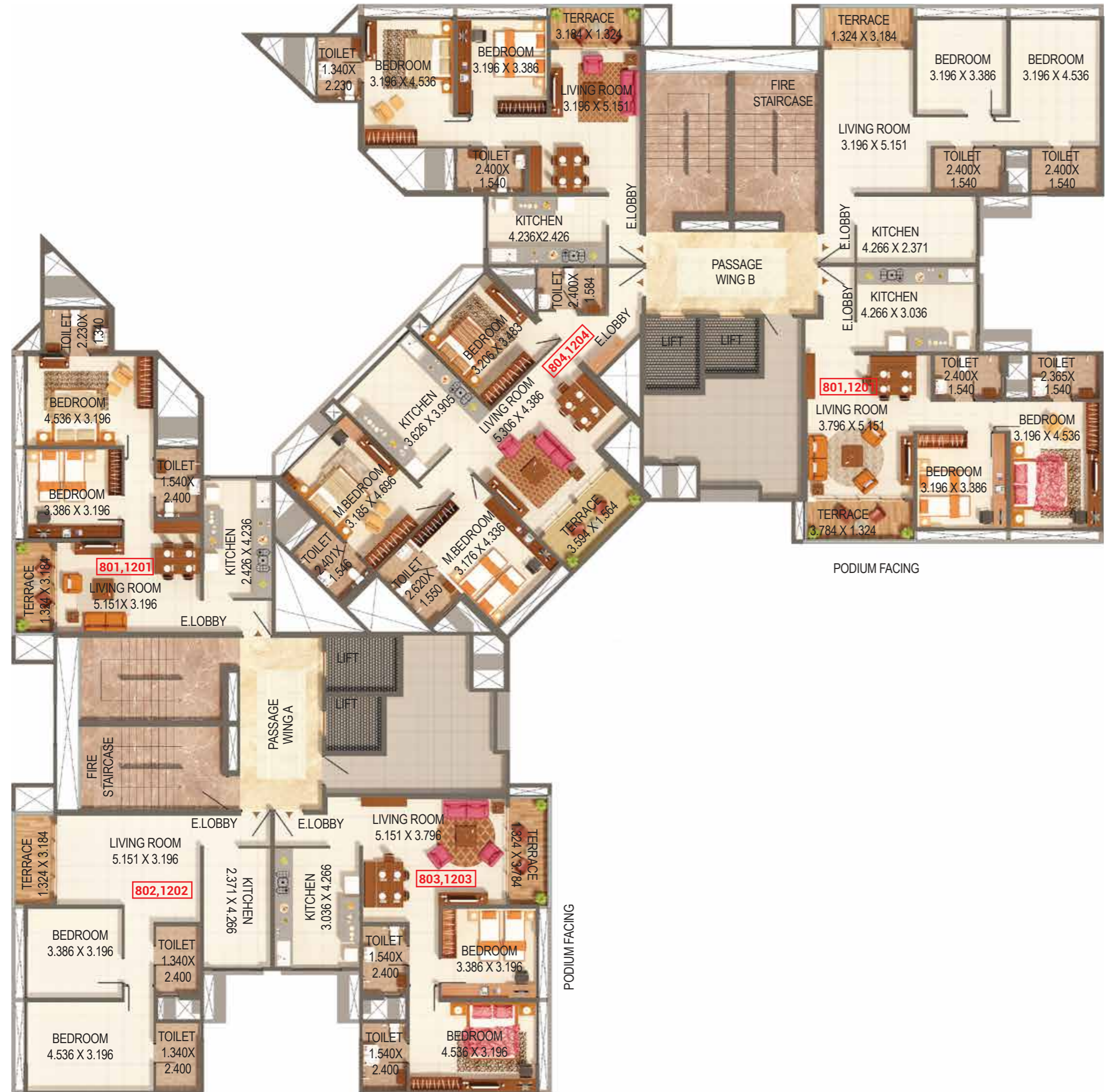
WING 'B2' 8th,12th FLOOR (AREA IN SQ. M)